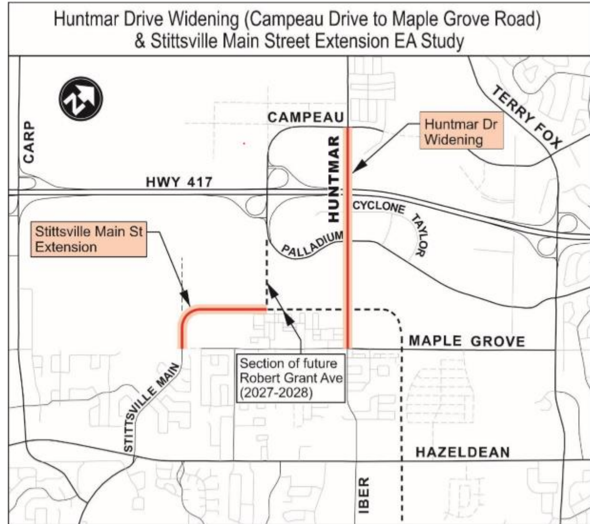
Figure 2: Huntmar Drive Widening and Stittsville Main Street Extension